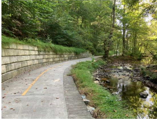
Bolin Creek Greenway