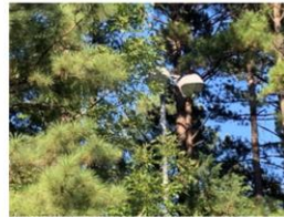
Investigating Acoustic Screen (Noise Reduction)